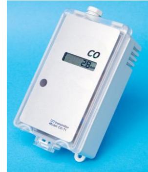
CO-T1D wall mount model with LC Display