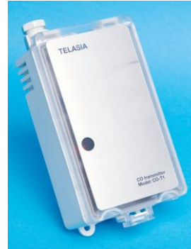
CO-T1 Wall mount model

The CO-T1 is a simple CO sensor/transmitter designed specifically for these applications. It delivers all the advantages of electrochemical sensing in a durable, long life (5-year) package and at attractive low price. The 2-wire loop powered sensor delivers a linear 4~20mA output that is easily integrated into any building control, ventilation or alarm system.