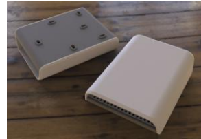
VC2007 IP20 wall housing without display

VC2007 helps you save money by decreasing your energy consumption while maintaining a healthier indoor climate!