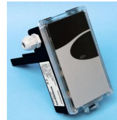
VC2007-KS IP65 duct housing without LC display